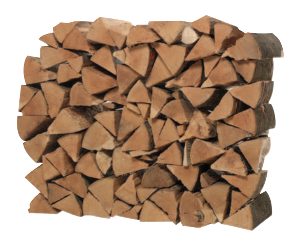
Fuel is burnt so economically and completely that in tests the ash produced from burning a 100kg stack of logs can fit into a pint glass.

Making a stove which will burn wood is very simple and cheap. Producing and designing a top quality stove which will burn wood efficiently and cleanly is very difficult and is expensive. During product approval, when the European test house was measuring the emissions from the Burley stove, the combustion was so clean they assumed that their gas analyser had broken and sent it away for recalibration.